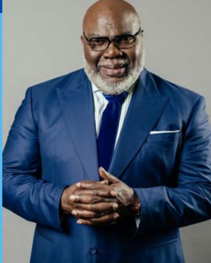
T.D. Jakes Chairman

As we look ahead to 2023, we have ambitious goals to increase our impact across the nation and around the world, and we need each of our partners and friends to join us. Thank you for your generous past support, and for the impact we have made together. And thank you for joining us in the transformational work ahead.